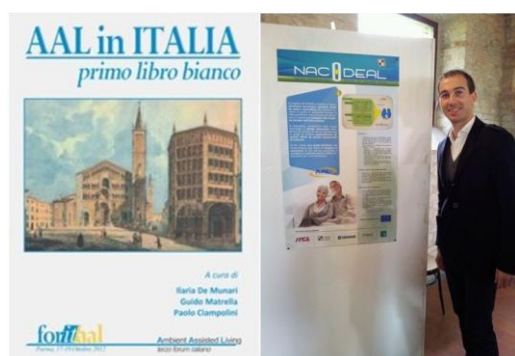
Parma, Foritaal 2012