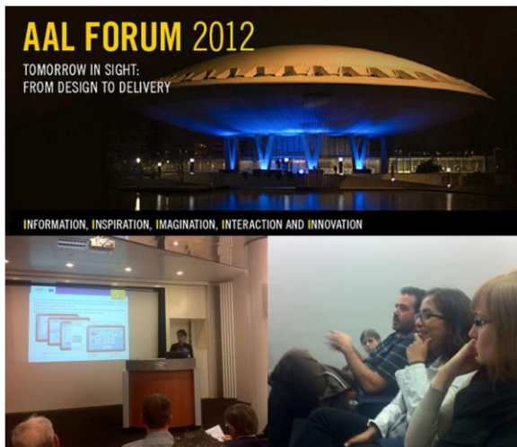
Eindhoven, AAL Forum 2012